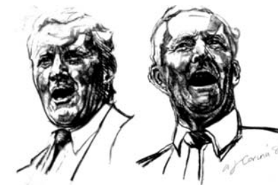
Charcoal Image of Tony Benn from the Collection

Whilst we will be celebrating our new image with our open weekend we couldn't resist the temptation to have a formal launch. Tony Benn has very kindly agreed to cut the proverbial ribbon the previous Sunday, the 18th January. It's a bit awkward for us because we would have loved to have been able to make an open invitation to all our hundreds of friends and supporters, but Jubilee House space dictates a maximum number of not many more than 50. Regretfully we have had to restrict invitations for the day and hope you all agree that initial invites should go out to those most involved in keeping the show on the road and those who have put in a lot of hard work over the last few months helping us to put things together. With over 40 active volunteers at the moment it doesn't give us much left over.